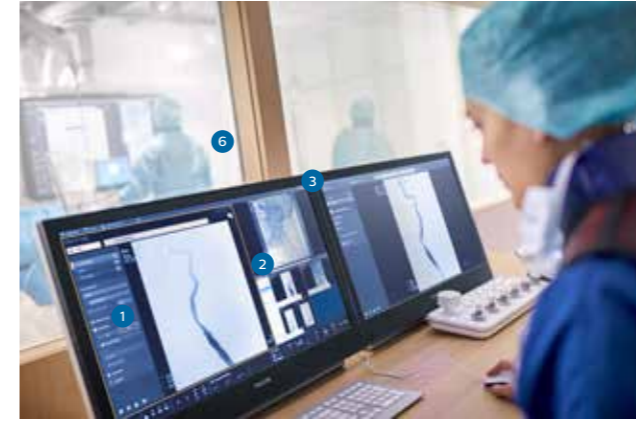
Figure 1: The key new workflow features of Azurion. 91% of the users considered the user interface of the Azurion system the most attractive design of all interventional X-ray systems they know.