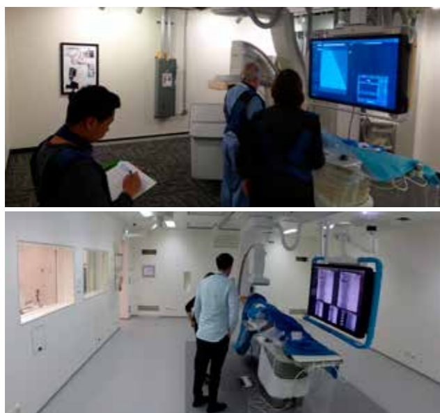
Figure 2 Study environment (examination room) in the USA (top) and Europe (bottom)

The study was conducted with participants that had relevant working experience in the interventional lab. During the study, the participants received training and hands-on practice with the Azurion system, and questionnaires were administered. In these questionnaires, participants were asked to indicate their level of agreement with multiple statements around the topics of workflow efficiency, workflow consistency and intuitive user interaction.